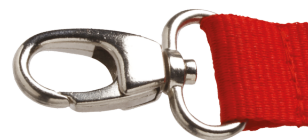
Mousqueton VIP VIP hook Mosquetón VIP