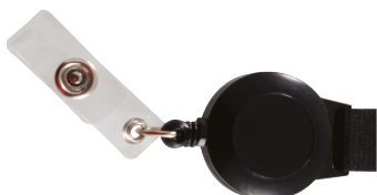
Zip intégré Badge reel Yoyo retractil