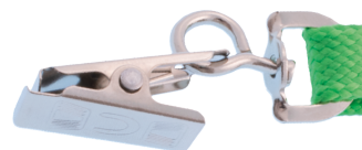
Pince croco Crocodile clip Pinza cocodrilo