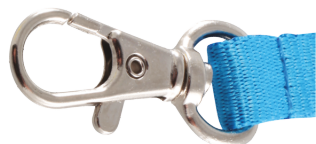
Mousqueton standard Standard hook Mosquetón estándar

Attachment, fixation & accessories - Soportes de sujeción, fijación y accesorios