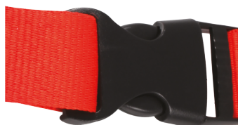
Boucle détachable Plastic detachable buckle Hebilla