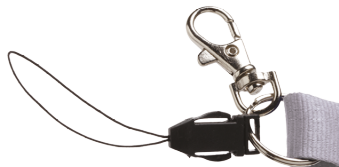
Mousqueton standard & attache téléphone Standard hook with mobile phone holder Mosquetón estándar y hebilla para teléfono móvil